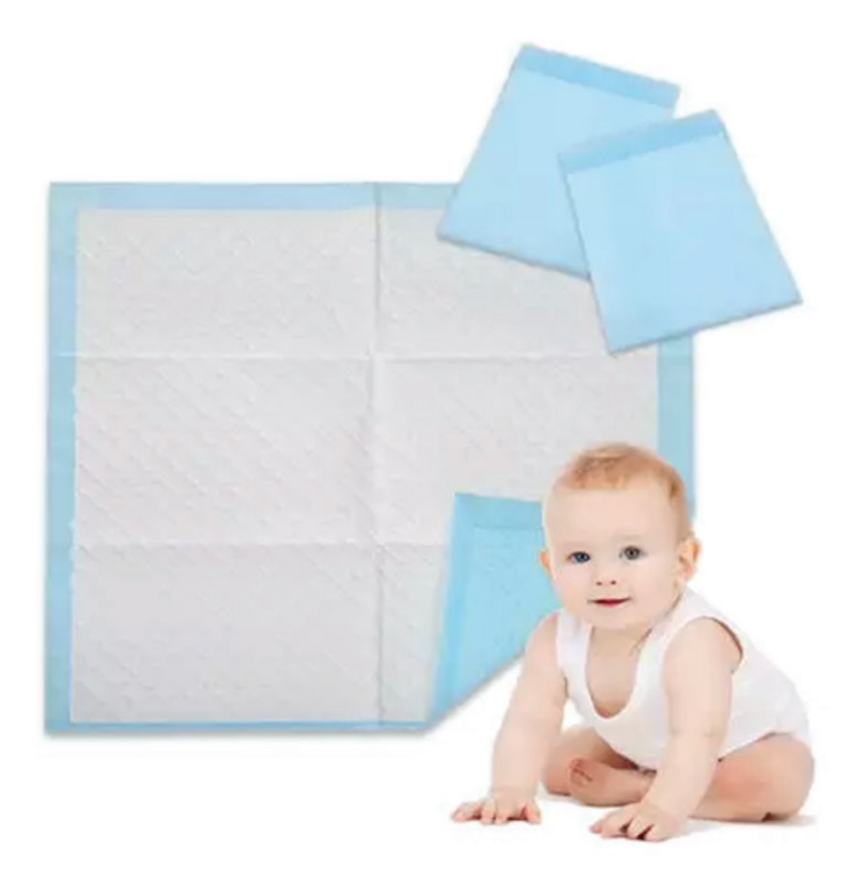
Out putted products from this machine